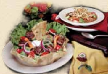
Fajita Salad & Tortilla Soup